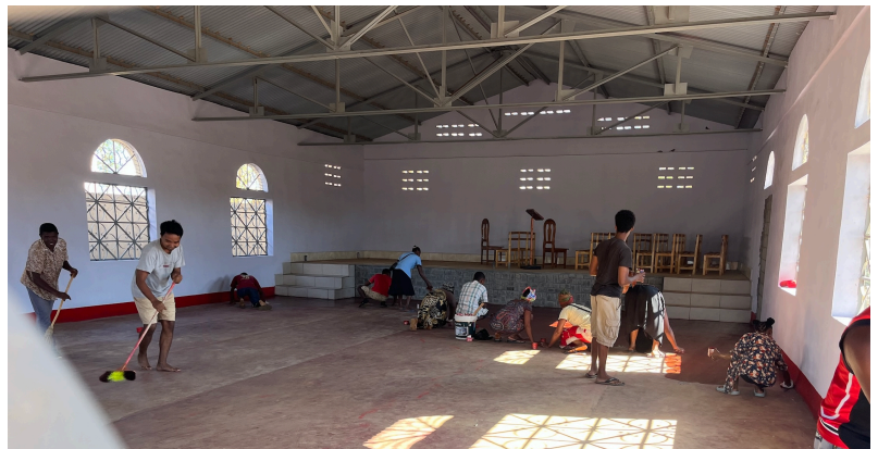
Waxing the floor