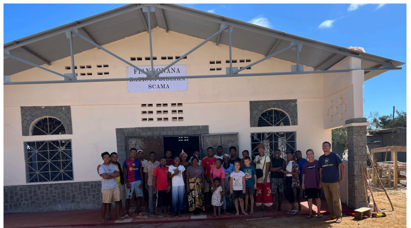
People who came for first church workday

We are careful taking pictures since foreigners don't have the best reputation in our town. Until a solid relationship has been built with the individuals, or until it's culturally appropriate for us to take a picture, we try to take pictures unnoticed. For that reason, sometimes we don't yet have pictures of specific people or ministries we'd love to share with you!