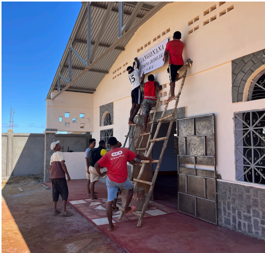
Hanging the church sign