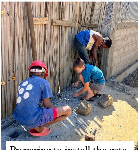
Preparing to install the gate